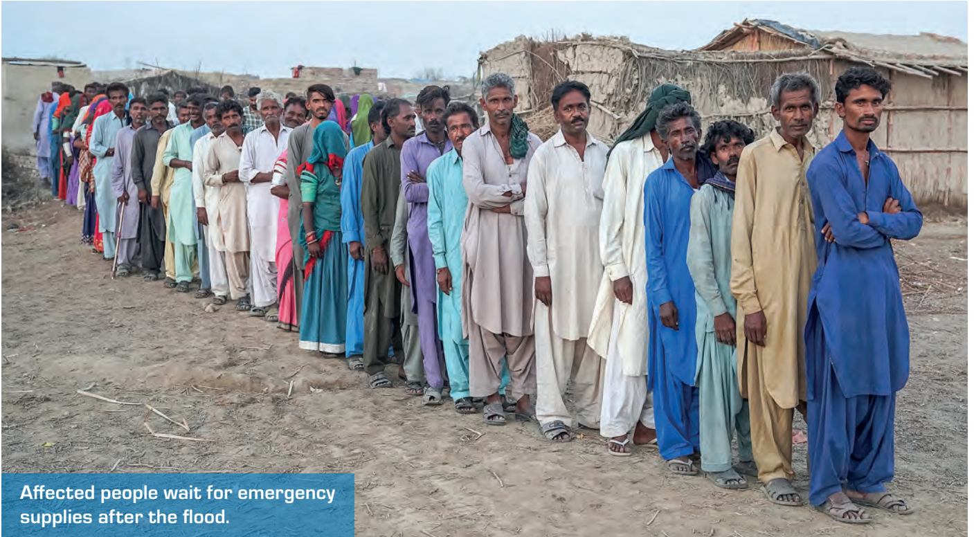
Affected people wait for emergency supplies after the flood.

Pakistan is regularly affected by floods and other natural disasters. SwissRelief's partner responded quickly to heavy rains and floods in Sindh Province in 2024, organizing extensive relief measures. In three days, the local team packed 600 hygiene kits, 400 tents, 600 food