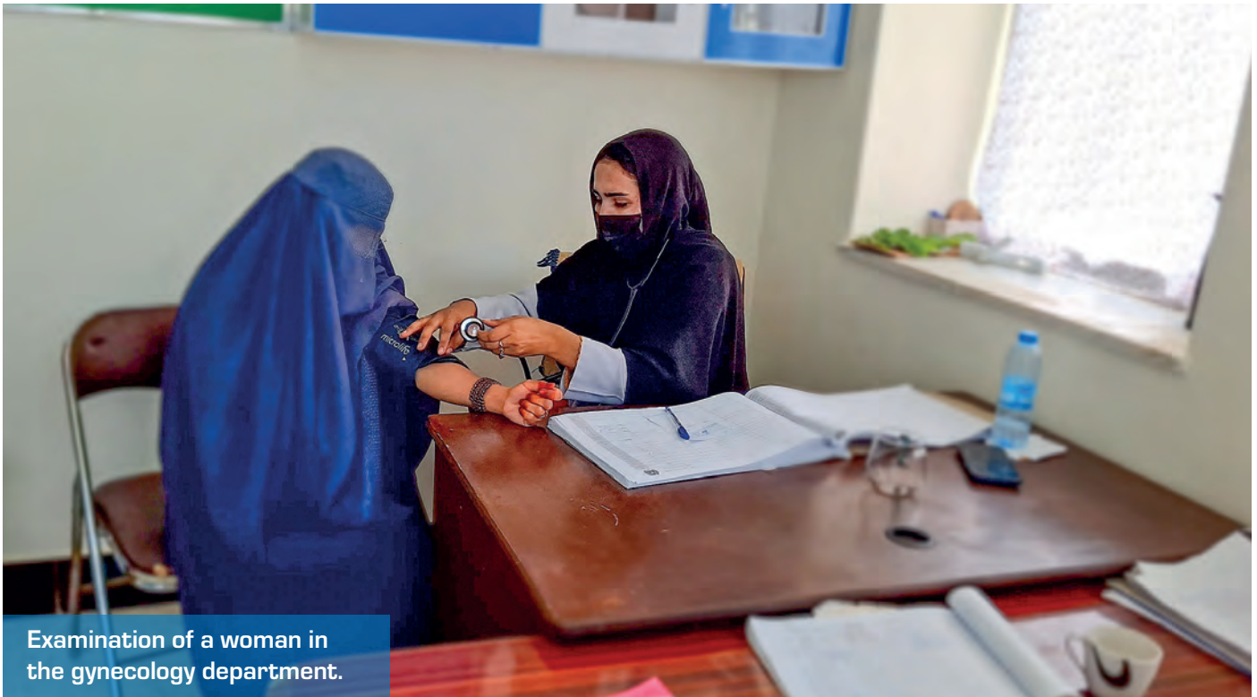
Examination of a woman in the gynecology department.

Despite small progress such as a decline in acute food insecurity, the situation in the country remains catastrophic. Financial constraints force many organizations to cut their food aid. High unemployment and low wages make food unaffordable for many, even when available. In 2024, SwissRelief supported 21,420 families with food packages, blankets, and winter jackets. Many recipients were widows, people with disabilities, or internally displaced persons.