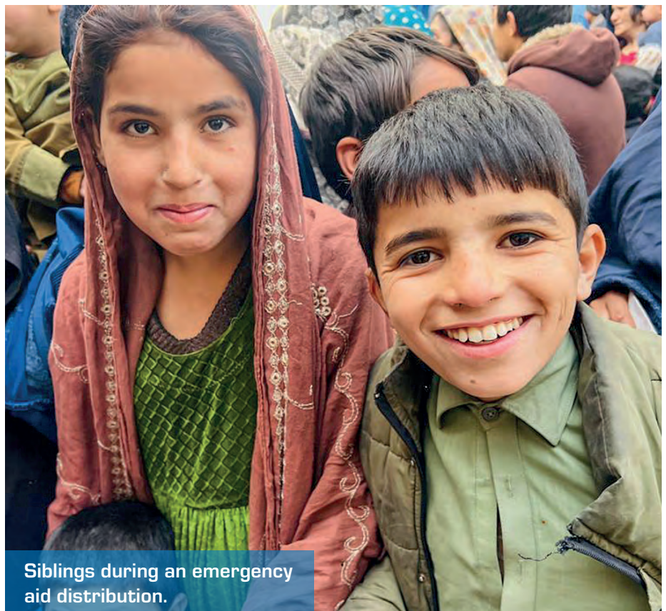
Siblings during an emergency aid distribution.

infection, she received antibiotics and education about hygiene and prevention. Her recovery inspired other women in the area to overcome barriers and seek help. ●