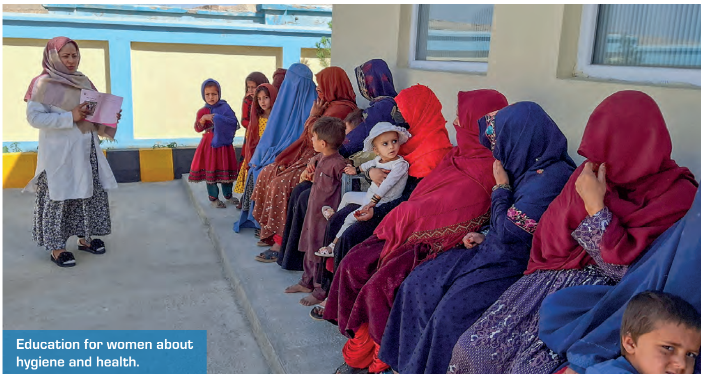
Education for women about hygiene and health.