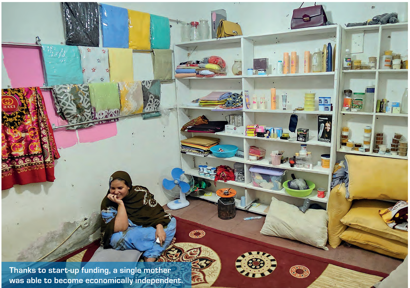
Thanks to start-up funding, a single mother was able to become economically independent.

What she earns beyond that is used to support herself and her two children. ●