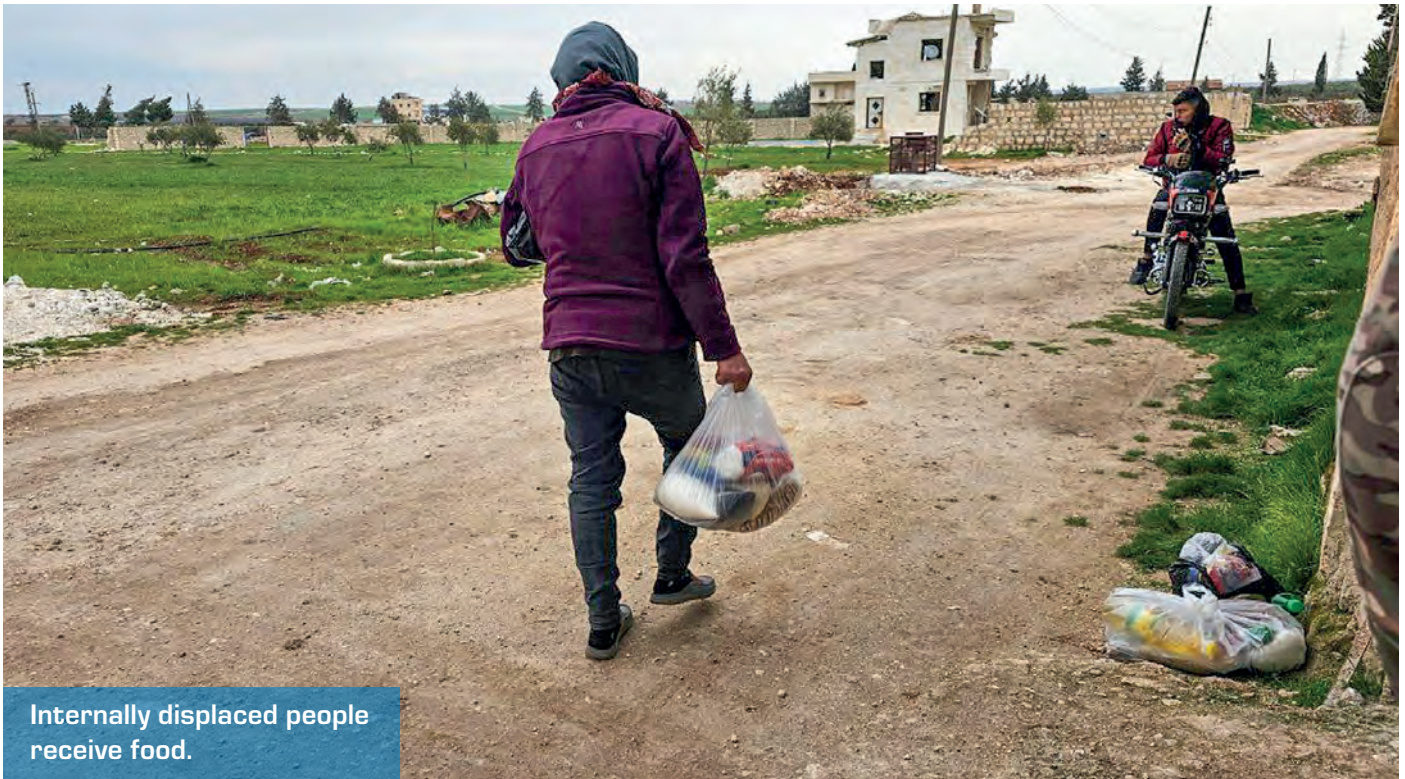
Internally displaced people receive food.

War, hunger, and displacement again marked the year 2024 for many people in the Levant. The Gaza war, fighting in Lebanon, and upheaval in Syria brought great suffering to the region's people. Many look toward an uncertain future with fear. In contrast, many look back gratefully who were helped by SwissRelief. SwissRelief