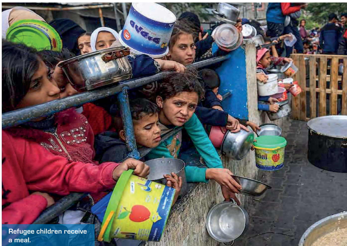
Refugee children receive a meal.

For years, SwissRelief has supported an educational facility in the West Bank with a kindergarten, a primary school, and a leisure center. There, children learn the value of reconciliation instead of joining the cycle of hatred between the hostile ethnic groups. This place became even more significant due to the war. The facility strengthens children's self-esteem, creativity, and ability to resolve conflicts. ●