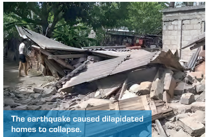
The earthquake caused dilapidated homes to collapse.

Through our friends, we were able to help five families rebuild and make their homes habitable again after an earthquake. ●